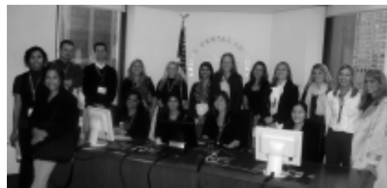
Students Visit ADA Headquarters